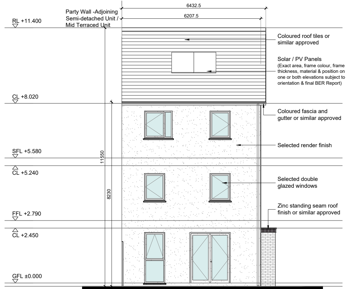
02 Rear Elevation