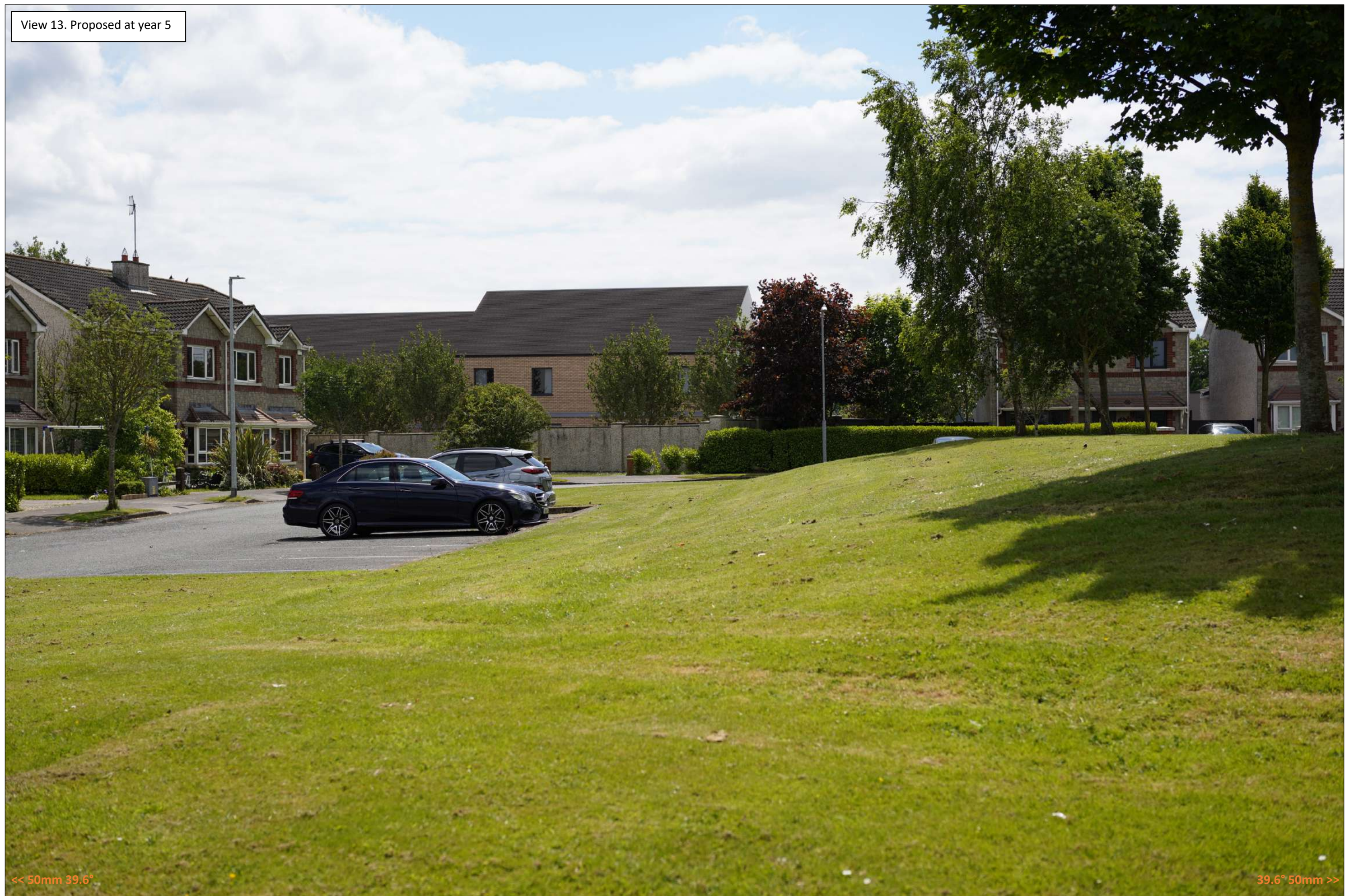
View 13. Proposed at year 5