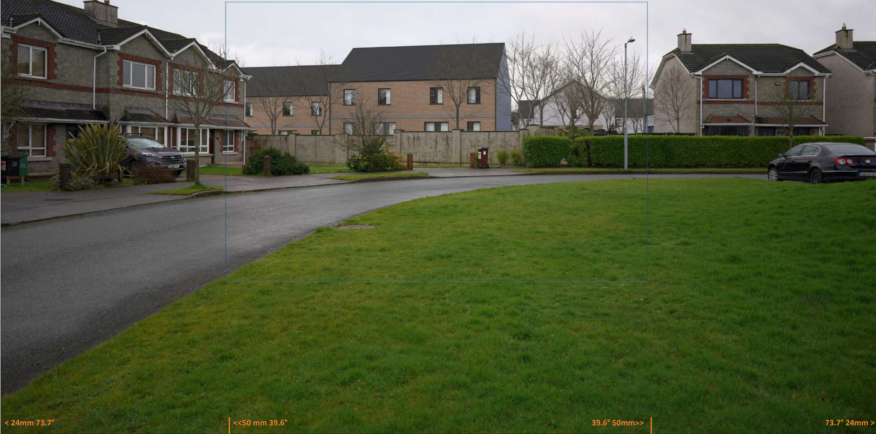
View 4. Proposed at year 10

< 24mm 73.7° <<50 mm 39.6° 39.6° 50mm>> 73.7° 24mm >