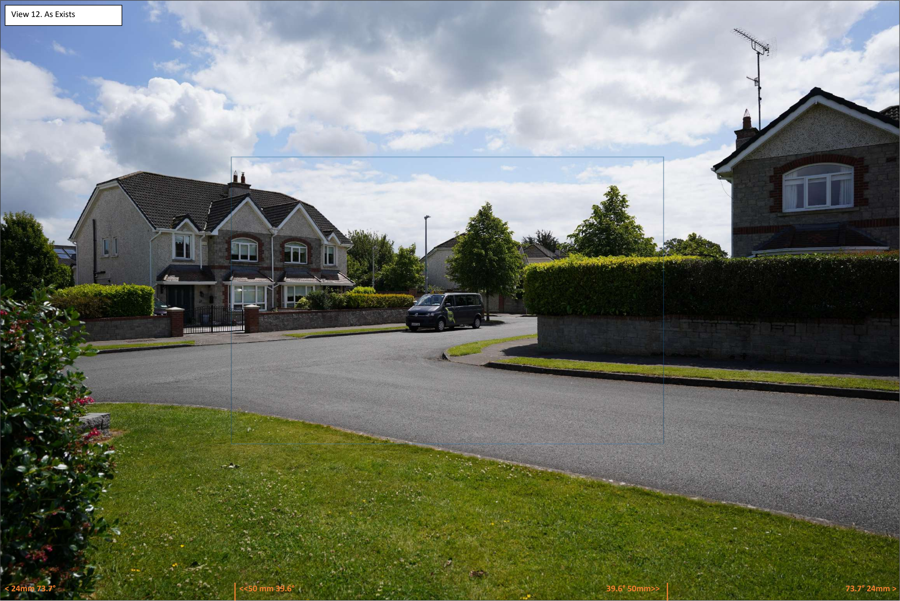
View 12. As Exists