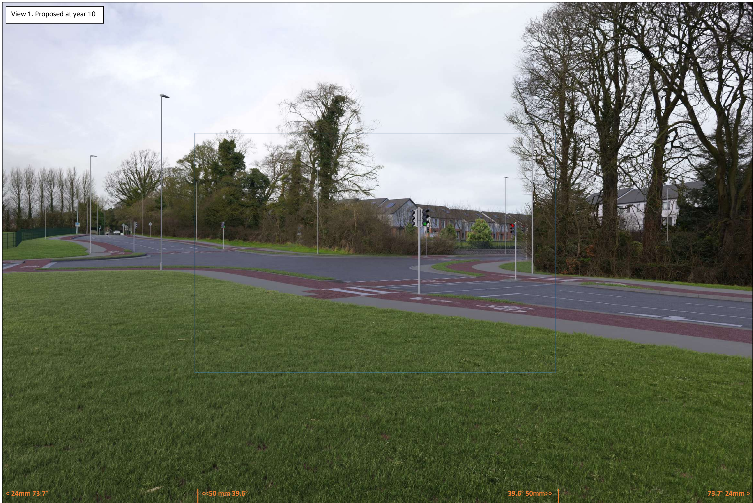
View 1. Proposed at year 10