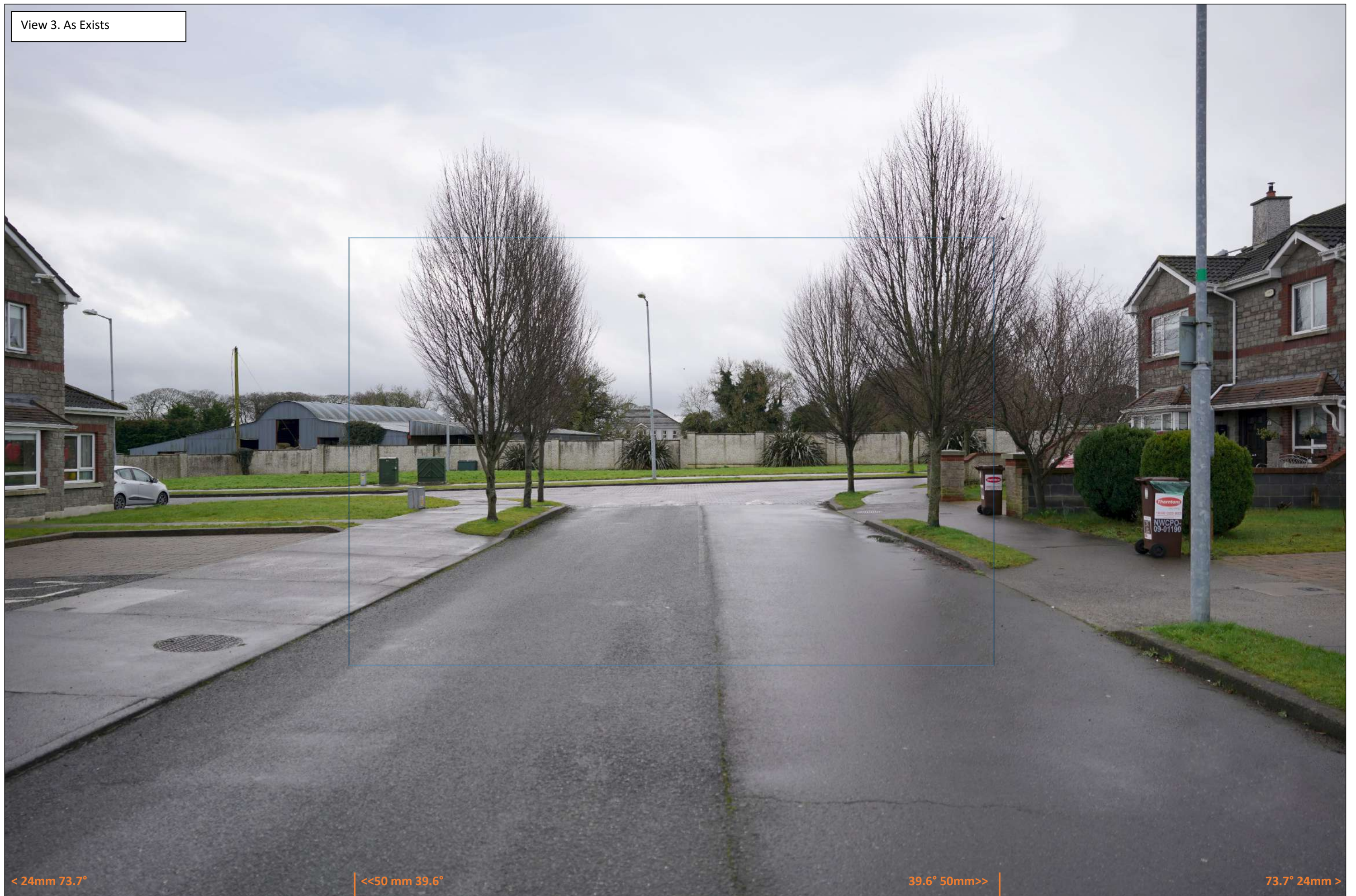
View 3. As Exists