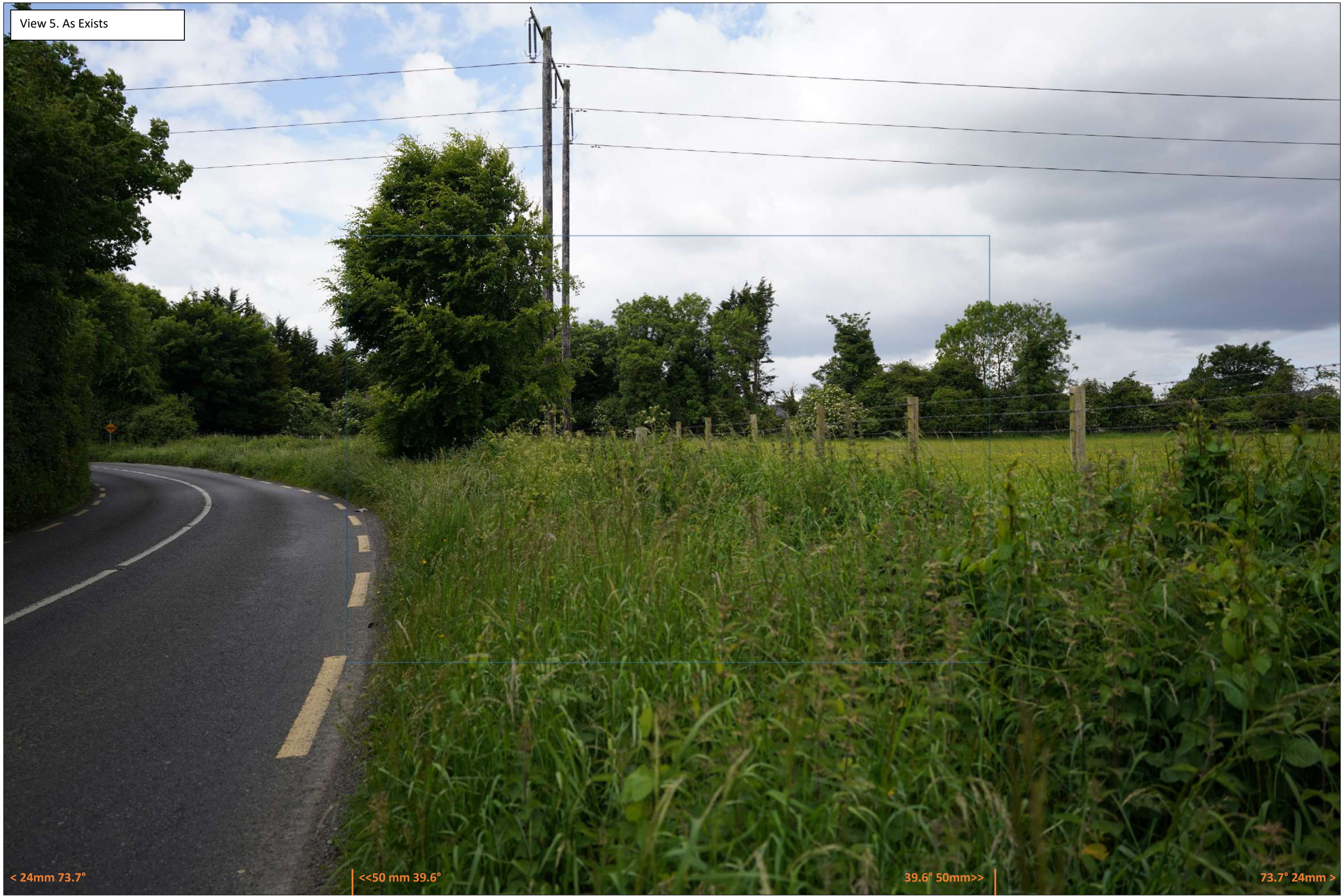
View 5. As Exists

< 24mm 73.7° <<50 mm 39.6° 39.6° 50mm>> 73.7° 24mm >