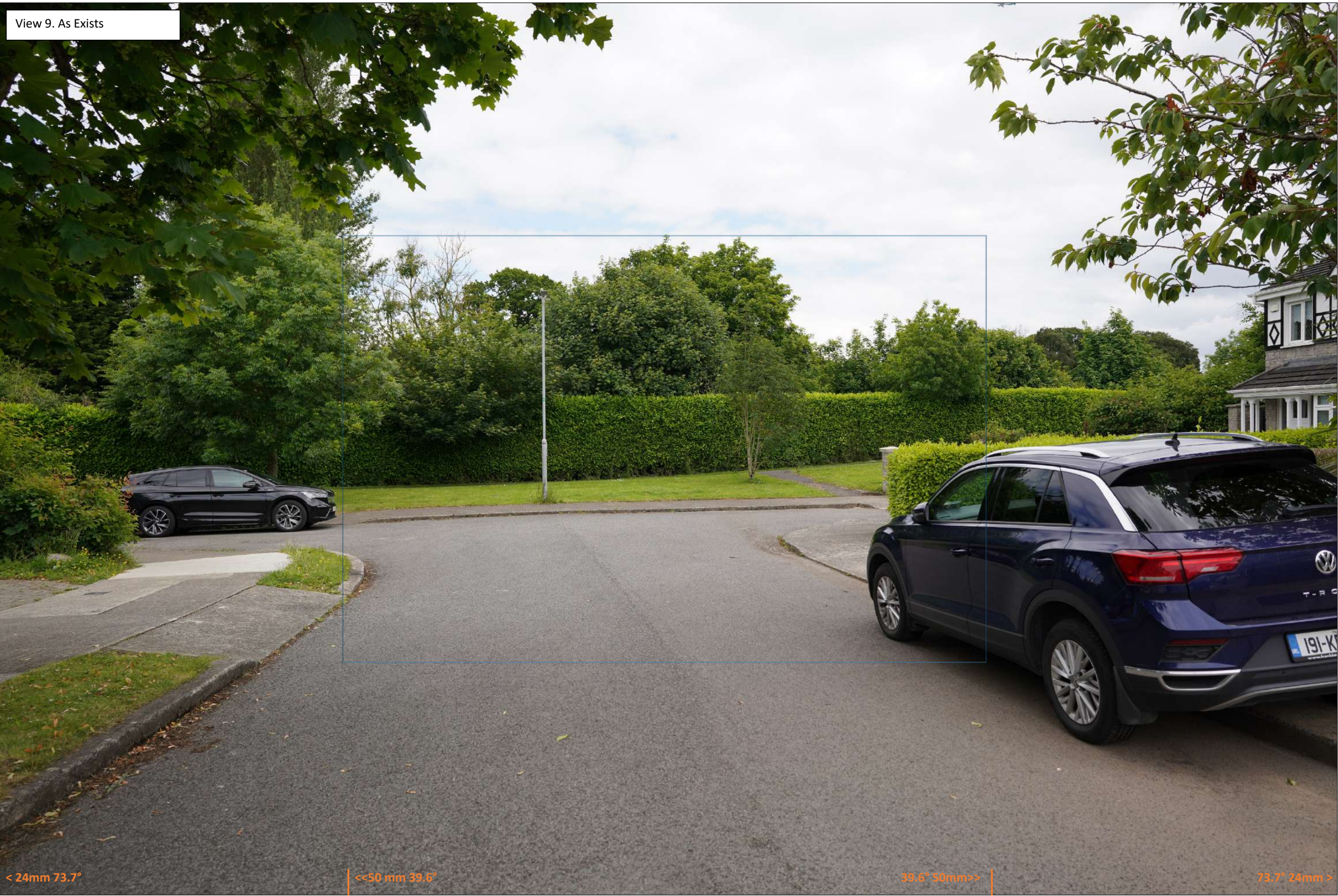
View 9. As Exists