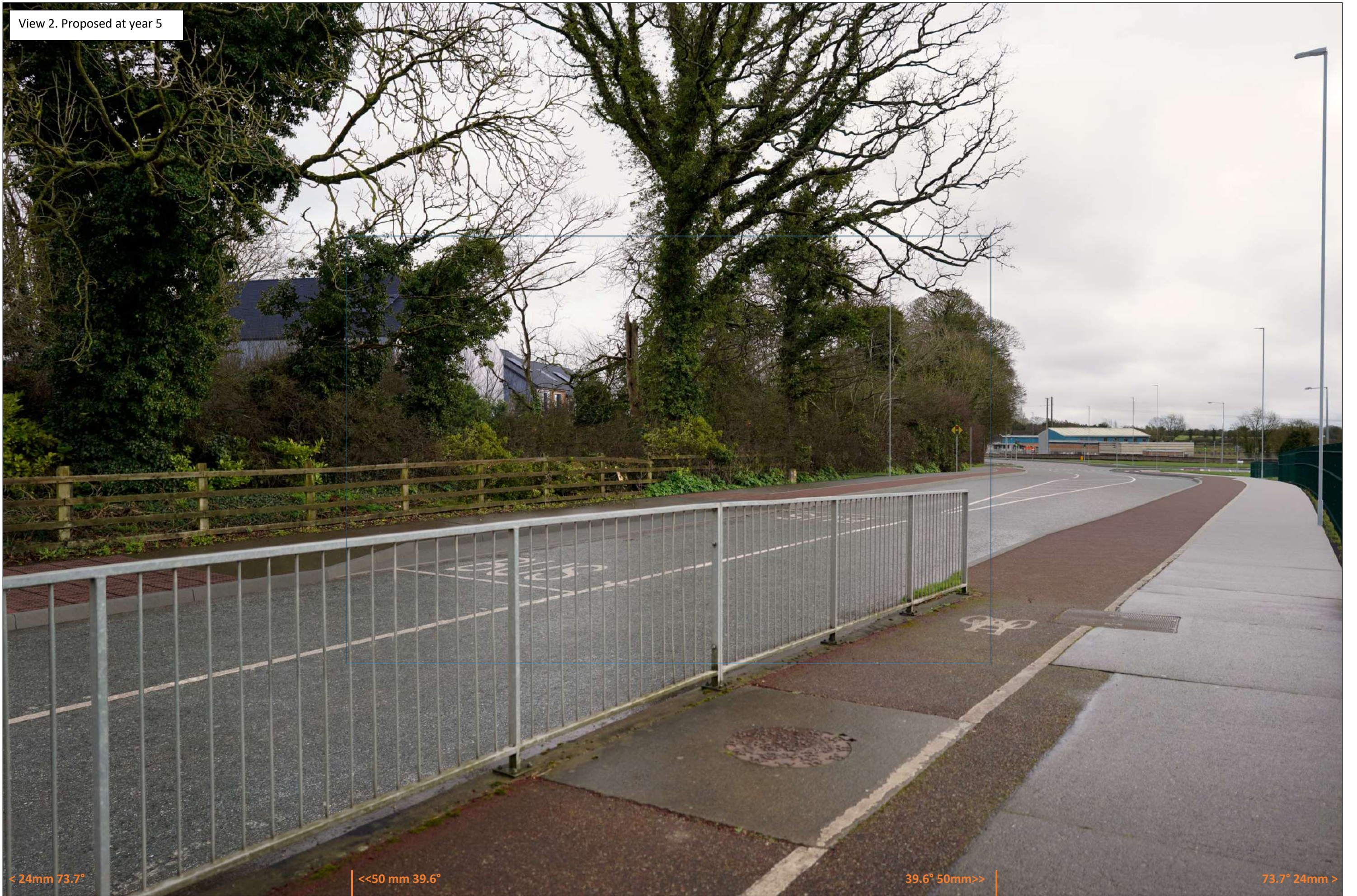
View 2. Proposed at year 5