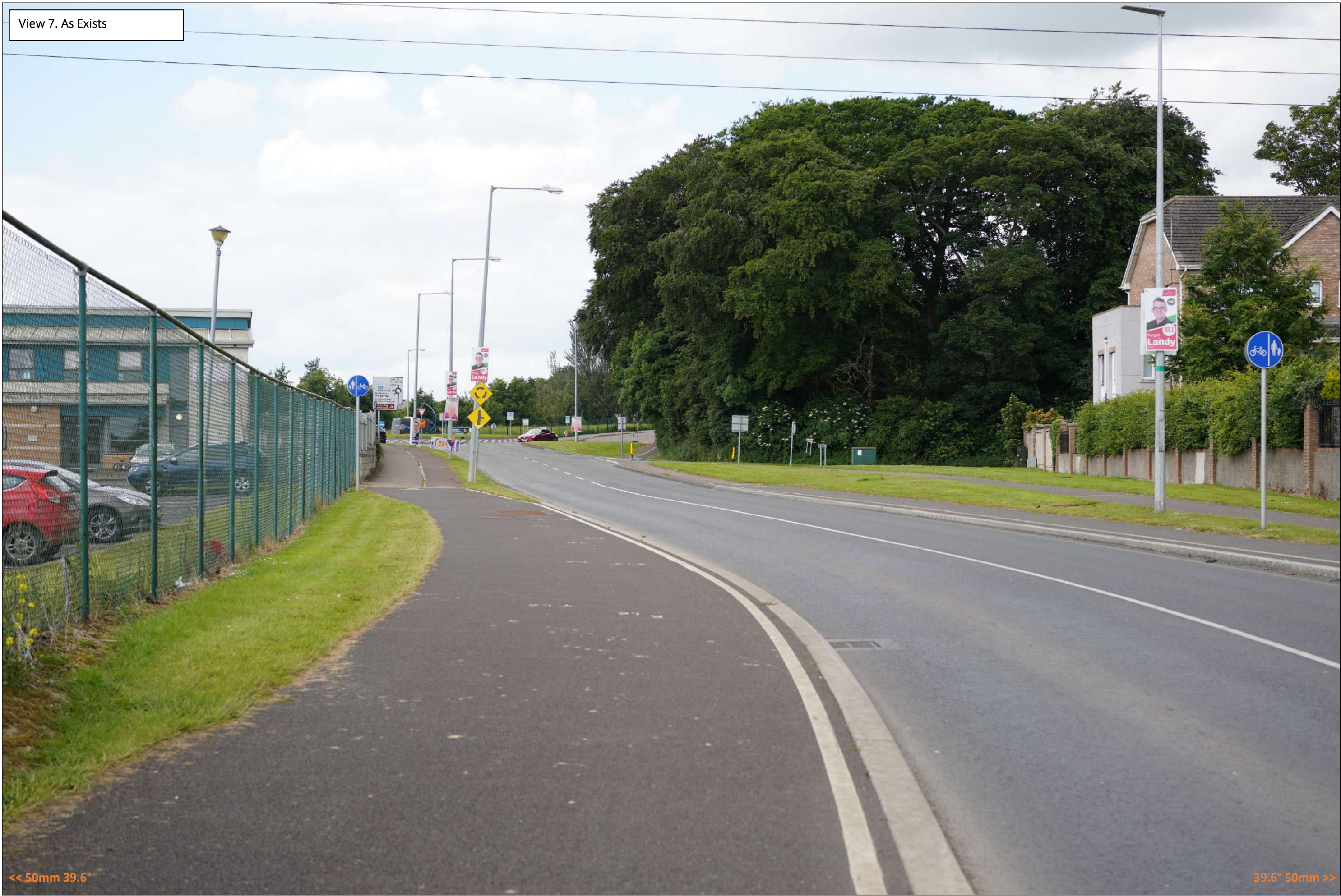
View 7. As Exists