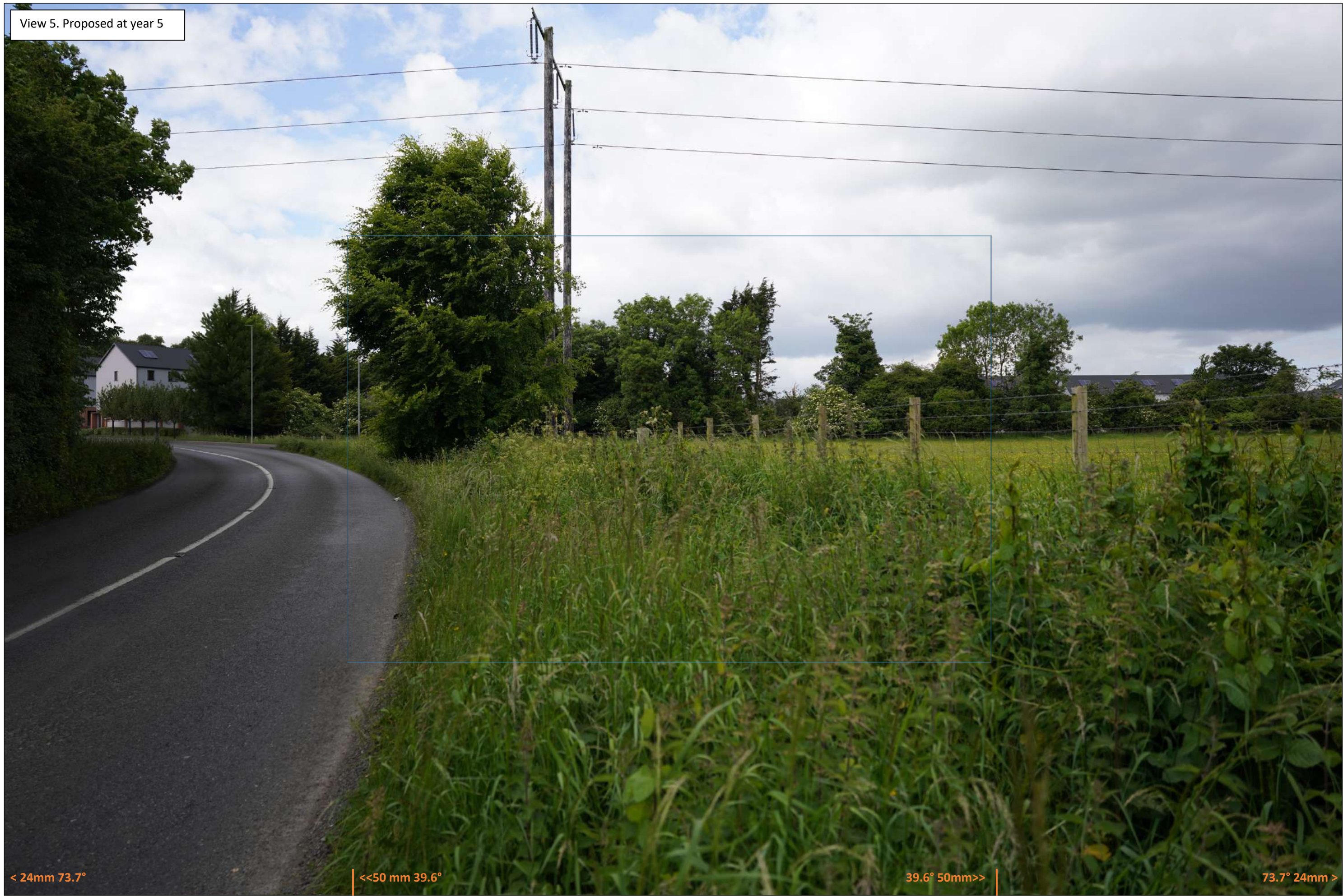
View 5. Proposed at year 5

< 24mm 73.7° <<50 mm 39.6° 39.6° 50mm>> 73.7° 24mm >