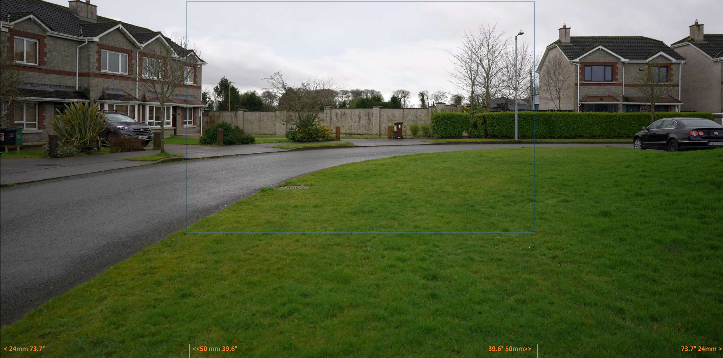
View 4. As Exists