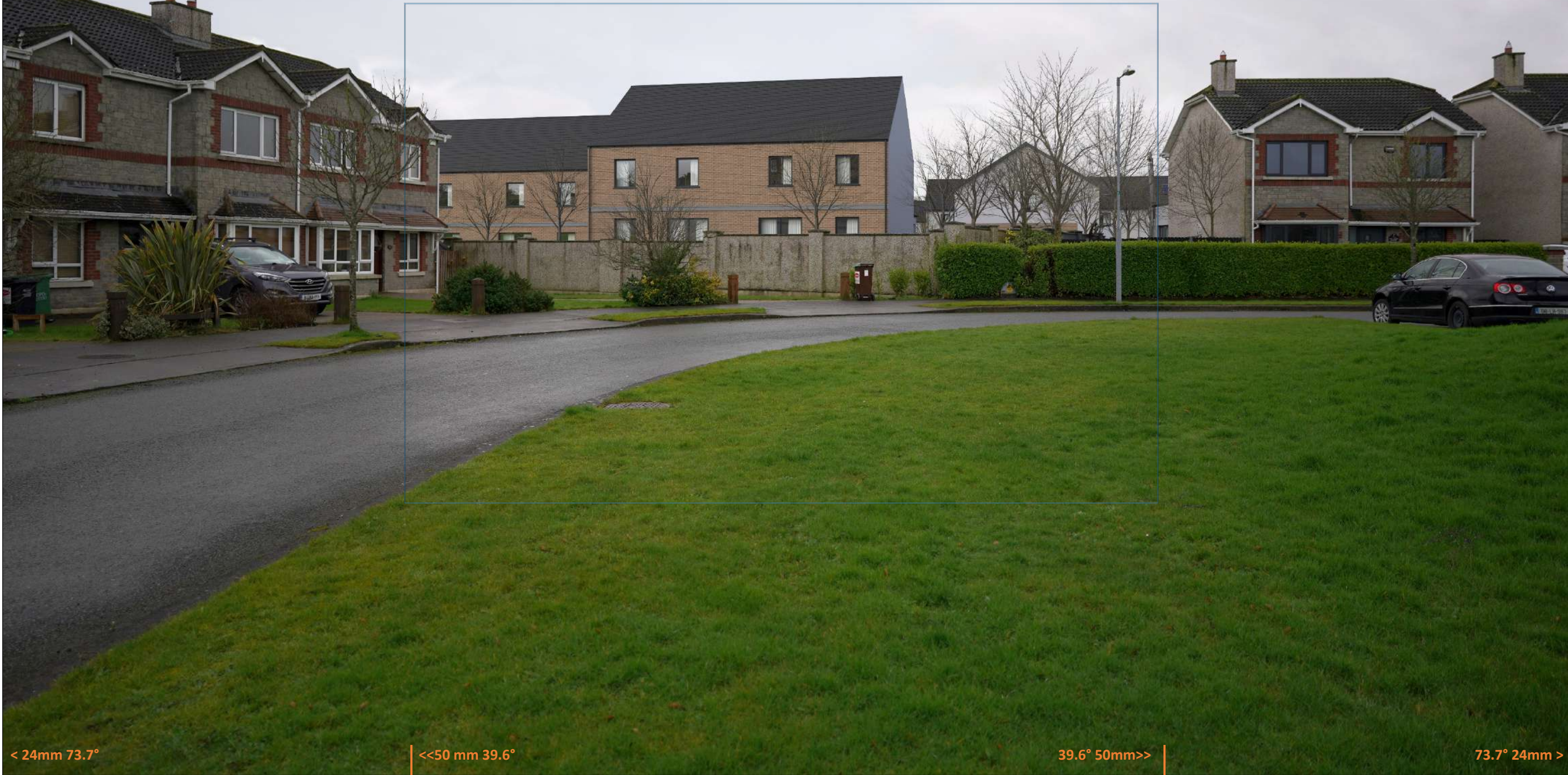
View 4. Proposed at year 1