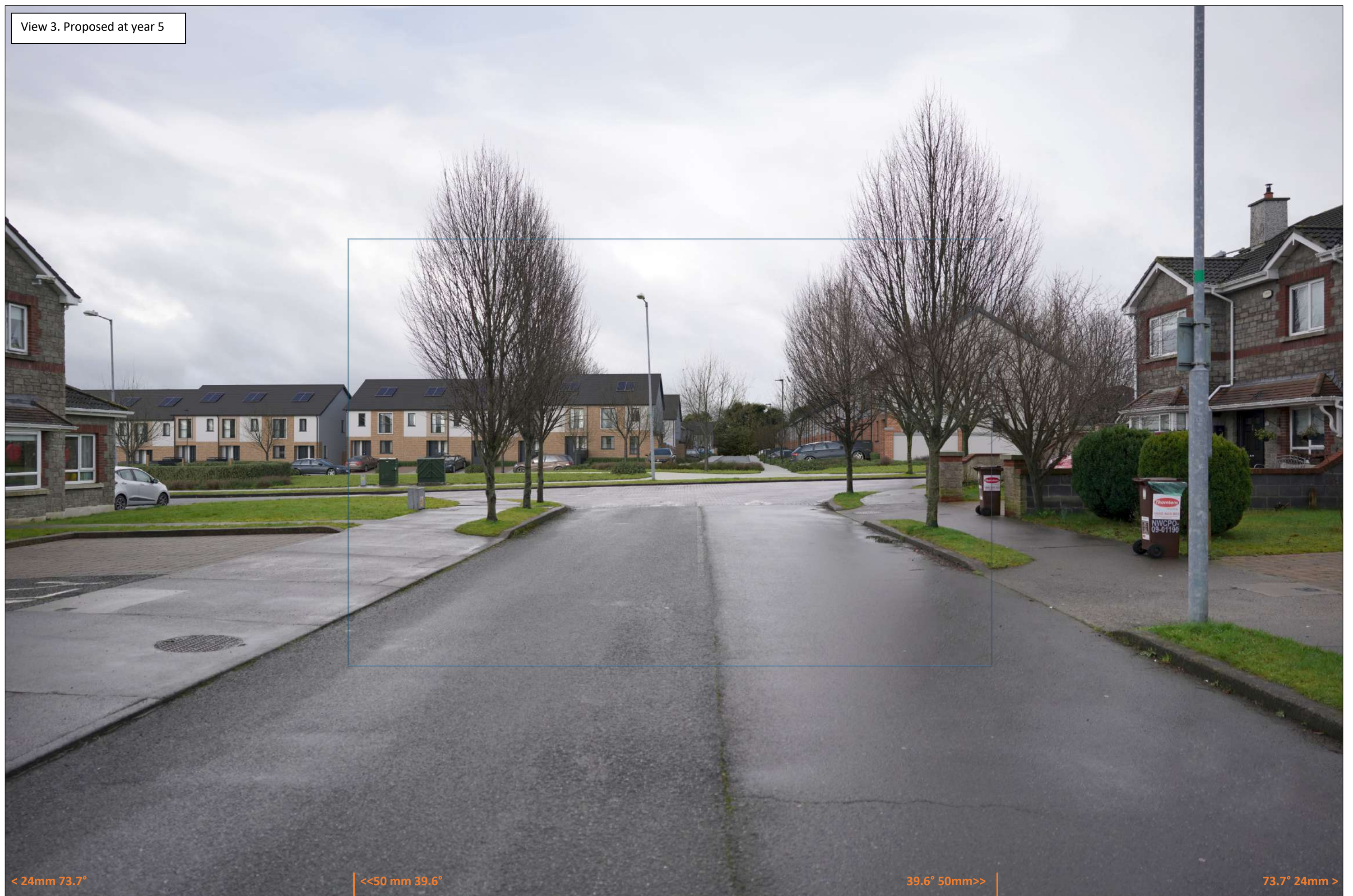
View 3. Proposed at year 5