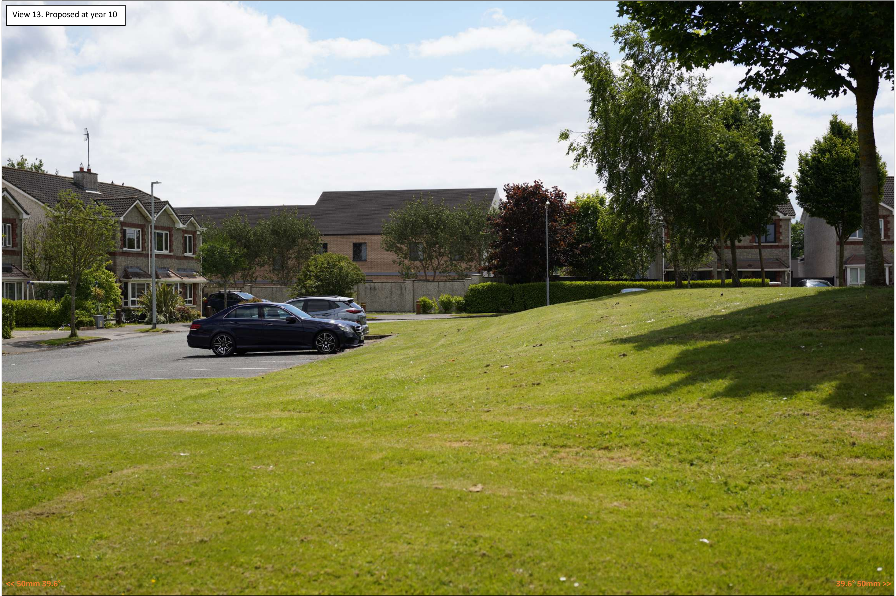
View 13. Proposed at year 10